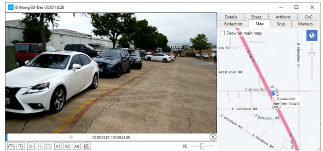
Built-in GPS Locator

The Model B's dedicated evidence handler accepts video evidence through USB or the docking station. Videos can be classified, tagged, stored, archived, and distributed in an environment that ensures security and maintains chain of custody. With it, the CopTrax Cloud, and Multi-dock, the Model B is an outstanding standalone BWC system.